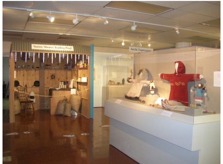
Part of the Spring 2010 Museum exhibit—Living on Top Of the World.