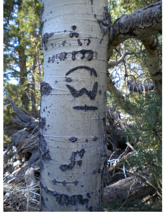
Aspen carving around Eagle Lake.