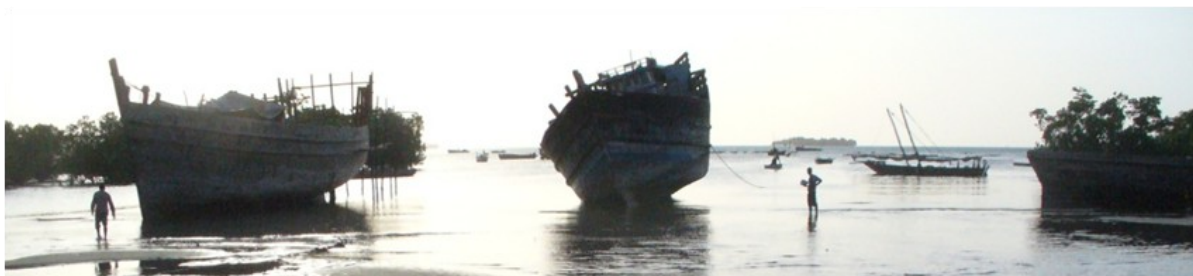
Dhow harbor, Zanzibar.

This year's field season was especially exciting. My goals for this field season included excavating the northern and final section of the Great House as well as finding and excavating what we hoped would be the plantation's kitchen. The kitchen in English colonial households was often a separate building adjacent to the main house to avoid the heat, smoke, and fire generated from cooking and associated activities. Well, we found it! During the first week of the excavation, remnants of the kitchen floor slowly appeared; by the fourth week, several walls, an outdoor patio, the floor and what