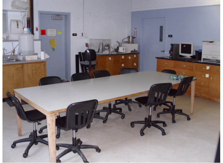
View of Human ID Lab, front room as of 2010.