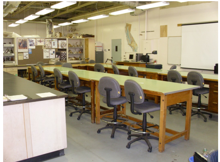
View of Archaeology Lab front room as of 2010.