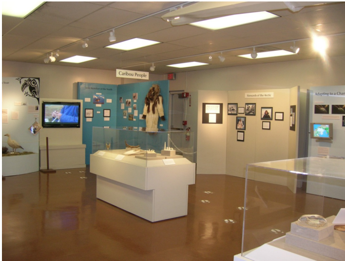
Part of the Spring 2010 Museum exhibit—Living on Top Of the World.